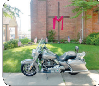
Joe McCormick 2017 Road King