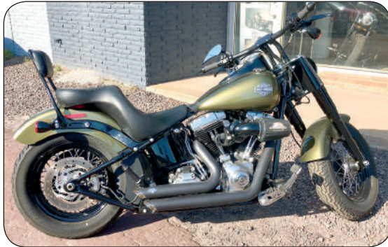
Mike Dante, Mountain Top 2016 Harley-Davidson Soft Tail Slim